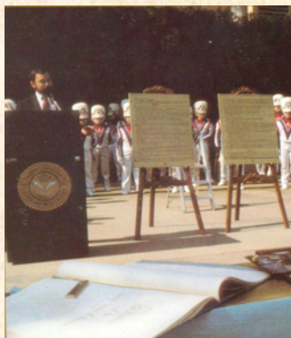
1987 Dedication Ceremony Garfield High School

The goal for each school is to raise $ 8,500 which pays for the purchase, delivery and installation of the five plaque set. A